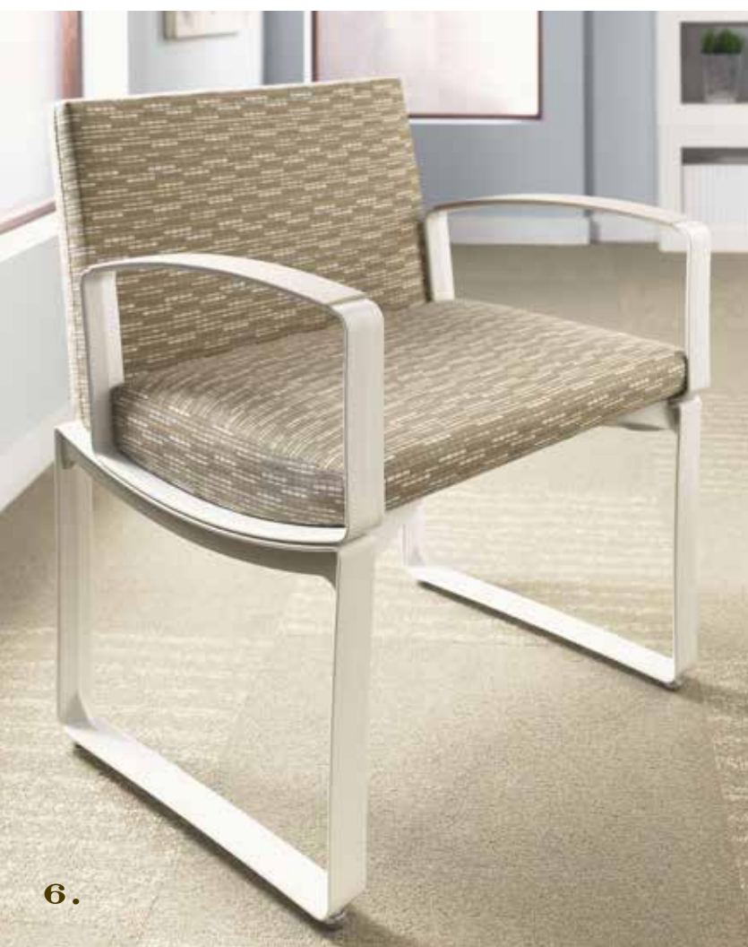
Lounge chair shown in optional bone white powder coat.