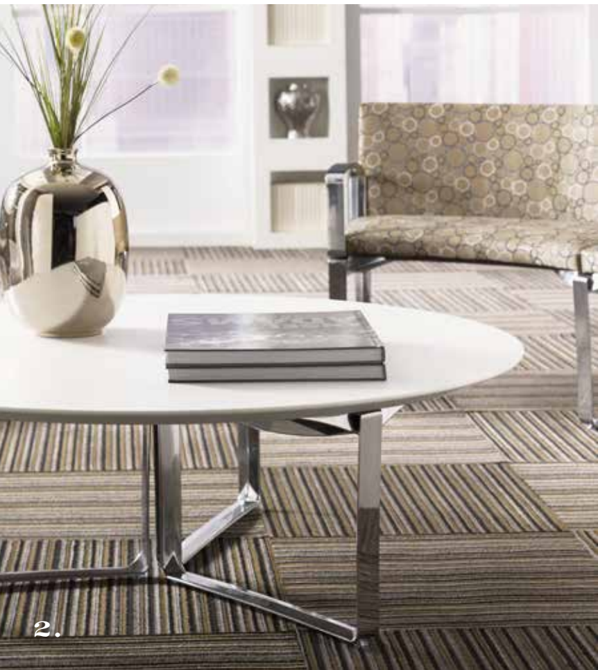
Ganging and free-standing tables are available in a variety of surface material options.