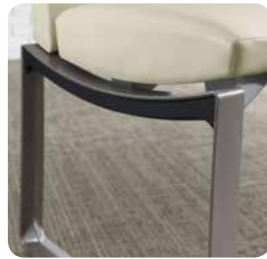
Black Resin Leg End Cap