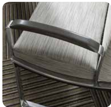
Wood Arm Cap