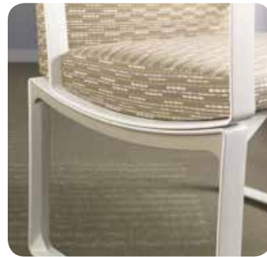
Beige Resin Leg End Cap