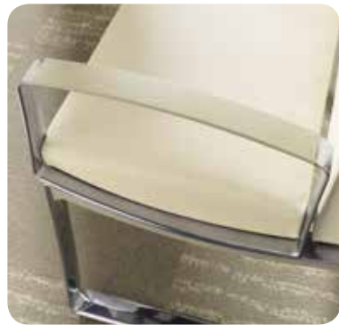
Beige Resin Arm Cap