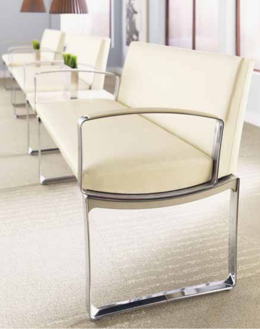
Standard polished aluminum leg & arm shown with beige resin arm cap & leg end cap.