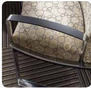
Black Resin Arm Cap