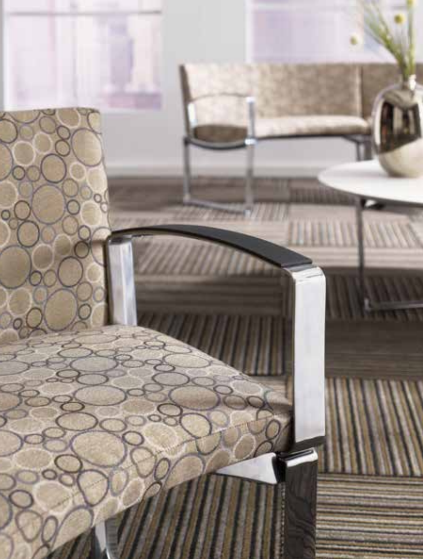
Standard polished aluminum leg & arm shown with black resin arm cap.