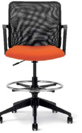
Ten stool with mesh back. >

With Ten mesh smart new look and a choice of stool, side or task version and a variety of fabric seats to choose, Ten mesh will blend right in with any office décor. Its wall saver frame is available in both silver and black. When it comes to strength, durability and sustainability, Ten's 13 gauge 1" diameter steel frame with Highmark's lifetime warranty will knock any competitor out of the ball park and it's rated up to 300 lbs. Mix and match both Ten and Ten mesh to any office environment to make that design touch at an eye-catching price point.