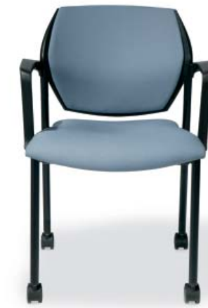
Fully upholstered Ten with casters. >