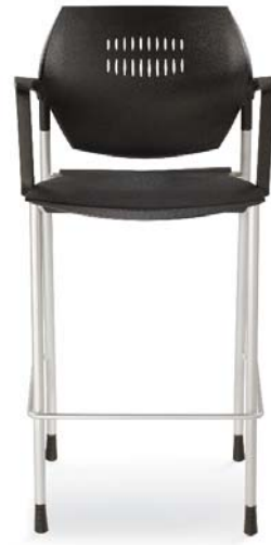
< Ten Stool with glides.

Design, Comfort and Flexibility. The Ten series chairs are available in six thermoplastic colors or with an upholstered seat & back for added comfort. Ten is also available in a black or silver wall saver frame with a basic task or swivel tilt control and comes with or without arms.